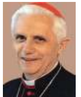
H. Em. Card. J. Ratzinger