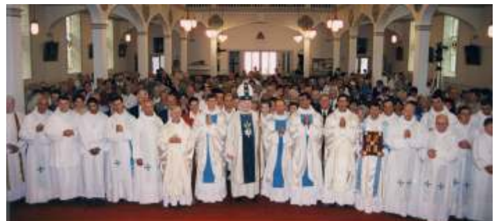
Ordination on August 14, 1999 - Arichat, Nova Scotia