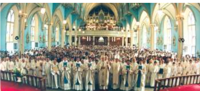
Ordination on June 23, 1996 - Cornwall, Ontario