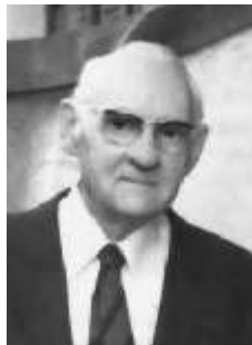
Hans Urs von Balthasar

1. Father Marie-Eugène de l'Enfant-Jésus in I Want to See God wrote: