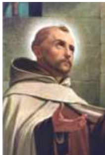
Saint John of the Cross