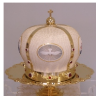
Tiara of the Father of the Church of John