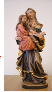
The three generations: Saint Anne, Mary and the Infant Jesus.