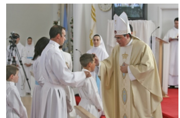
85 young people and 3 adults received the sacrament of Confirmation.

After the homily, the ritual of Confirmation took place,