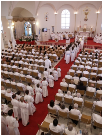
The entry of the children carrying daisies to the Lady.

Young people came to offer daisies to the Lady of All Peoples. Emilie Lavigne laid a crystal daisy on the altar, and she was followed by some fifty young girls and boys who put daisies on the altar and on a small table before the statue of the Lady of All Peoples.