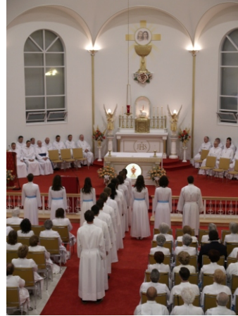
The human cross

The choir sang the very moving hymn "The Crucifix" by Jean-Baptiste Faure. It was followed by a commen-