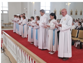
The new Marialys members