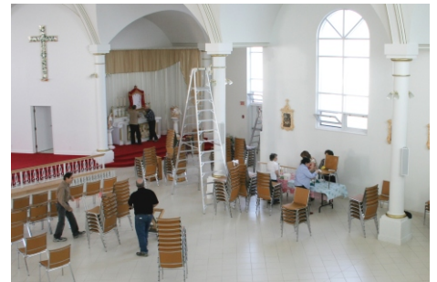
Every year, a group of volunteers undertake the task of spring cleaning in the chapel of Spiri-Maria.