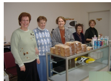
Rosa Lunch members—The volunteers who make and sell the sandwiches and beverages during our days of prayer.