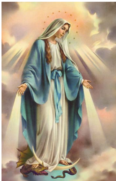
The Immaculate Conception

by God. Here are some examples that clearly illustrate the manner in which God acts: