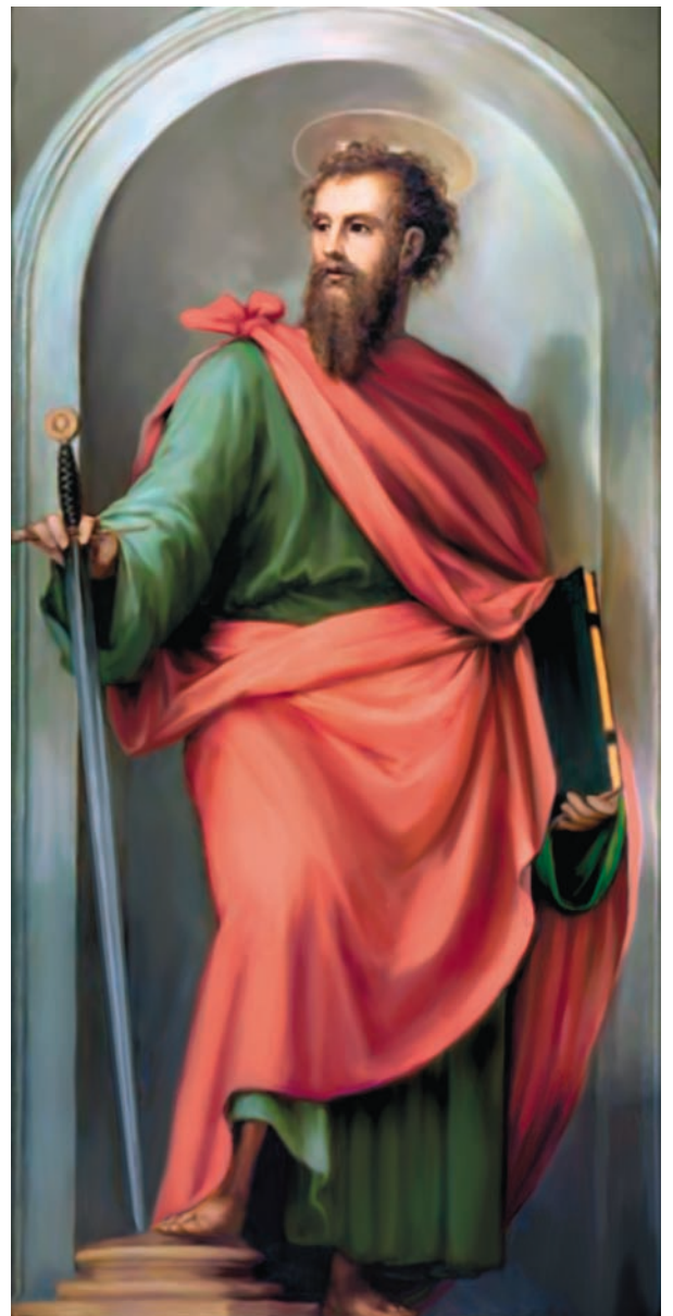
Saint Paul Apostle

God’s goodness has no bounds. It manifested itself even outside the boundaries of Israel. Why then should we feel threatened when it manifests itself outside the boundaries of the Church? (Luke 4:24-30)