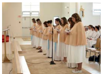
Nine mothers-to-be consecrate the child they are carrying to the Quinternity.

Wearing a golden yellow cape, nine expectant mothers consecrated to the divine