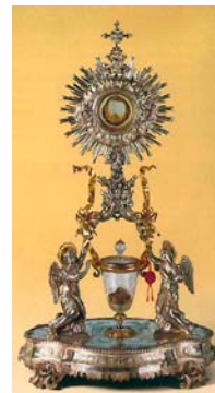
The reliquary containing the "miraculous flesh and blood" exposed for the veneration of the faithful at Lanciano.

celebrating Mass was suddenly overwhelmed by a serious doubt regarding the real presence of Jesus in the Eucharist, and immediately after the Consecration, the miracle took place. "The host became living flesh and the wine became living blood which coagulated into five irregular clots of varying sizes and shapes." These relics, which were carefully preserved, have undergone several tests over the centuries. In 1971, a new scientific study, which was corroborated by a scientific