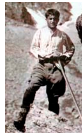
Pier Giorgio Frassati climbing to the summits.

"Every day, I am more passionately in love with the mountain; I am fascinated by it and I desire to climb to its summits, reach the most daring heights..., and if my studies permitted it, I would like to spend long days contemplating, in this pure air, the grandeur of the Creator. I understand the attraction for light, the desire to climb towards the summits, to find God face to face."