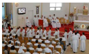
The young girls, followed by the boys, entered in procession as a decade of the rosary was being recited.

vation came into the world. May our 'Aves', uttered all along the way, sustain our courage and our hope... Thus, our hearts will be incessantly transported far above our cares, far beyond our anxieties, to the Kingdom of the beatitudes."