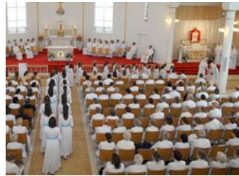
The group of young girls and boys entering in procession to the Repository.

ried a large reproduction of the Virgin Mother to be placed in the sanctuary, was followed by some sixty young people – the group of young girls preceding that of the young boys – each carrying a small plaque (or a holy picture for the little ones)