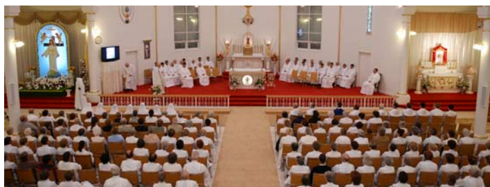
Friday, September 12 - The triduum in honor of the Triumph of the Cross began with a ceremony, the theme of which was the Eucharist.

Those studies supported the faith that it is truly the living Christ who gives Himself to us in the Eucharist, communicating to us "the benefits of His redemptive death and His glorious life".