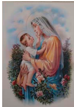
Small plaque of the Virgin Mary carried by young boys and girls.

illustrating the same painting. After having deposited their plaques next to the Repository, the young people received a souvenir holy picture of this tableau.