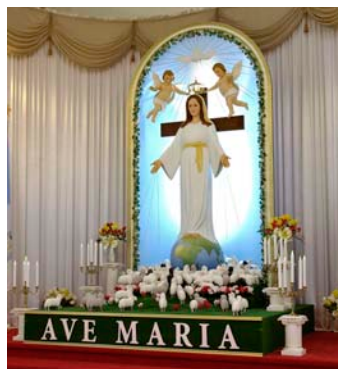
The letters "Ave Maria" borne in procession by little girls and placed before the throne of the Lady.

While a child recited a decade of the rosary, a procession of eighty young people (with the girls preceding the boys) was set in motion, going around the chapel. Little girls carrying the letters of the salutation "Ave Maria" were followed by other youngsters carrying a rosary in their hands, which they would then be able to keep as a souvenir. A soloist interpreted Schubert's Ave Maria as the letters of the "AVE MARIA" were placed before Our Lady's throne.